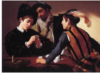
The Cardsharps Oil on Canvas 1595 Caravaggio

TO PROVIDE AND STIMULATE FOCUS ON THE ARTS