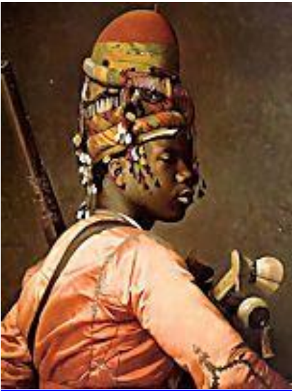
Black Bashi-Bazouk Oil On Canvas 1869 Jean-Leon Gerome